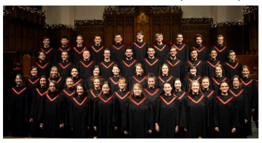
The Grove City (PA) College Touring Choir

The concert is open to all who would like to see it. The Grove City Touring Choir last performed in this area to a full house at Beverly Hills Baptist Church in 2012.