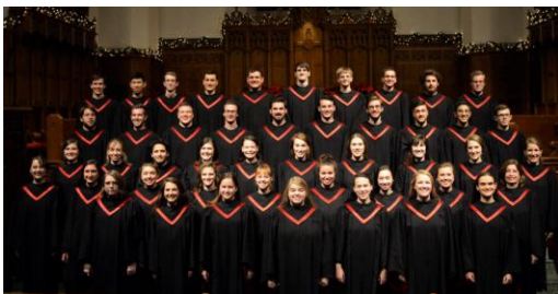
The Grove City (PA) College Touring Choir

The concert is open to all who would like to see it. The Grove City Touring Choir last performed in this area to a full house at Beverly Hills Baptist Church in 2012.