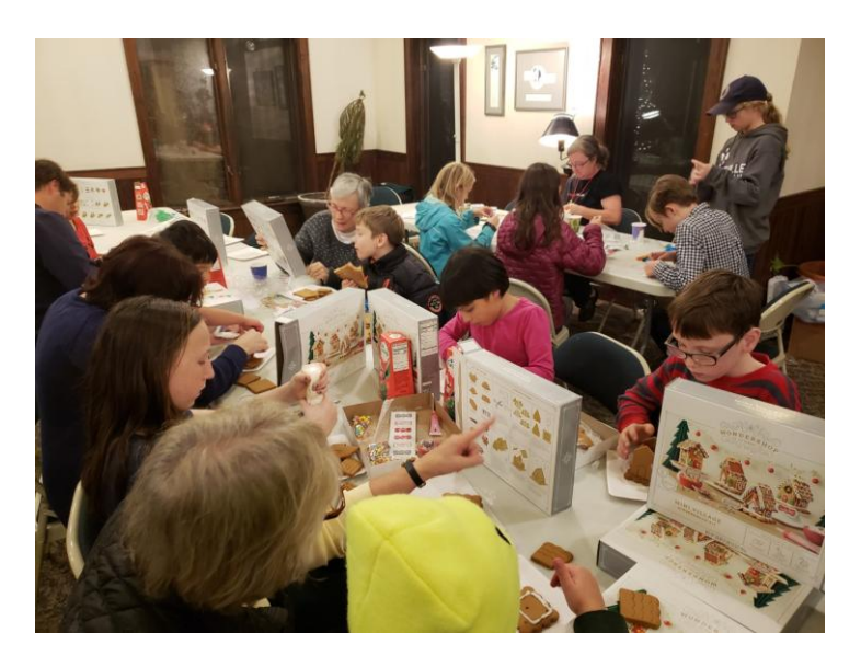
Our Christmas Party was so much fun... food, crafts and lots of icing for all!