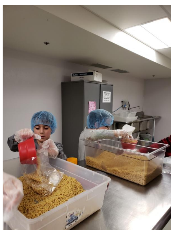
We have some very hard workers who like to help others!