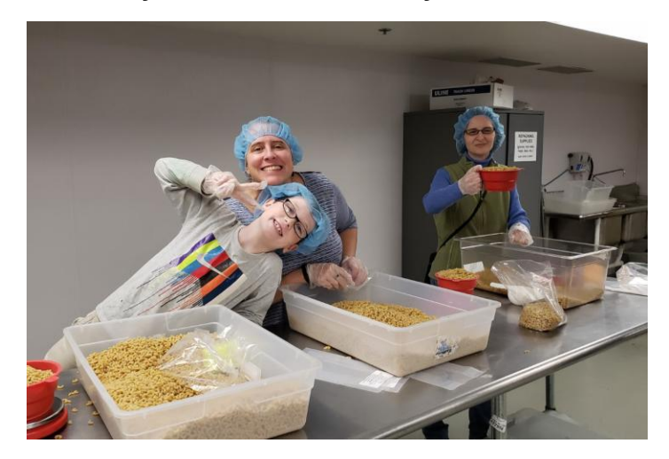
Saturday, December 1 our youth had a service day at Manna Food Bank