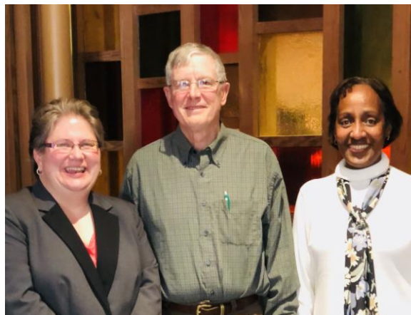
Submitted by Sally Broughton

Find a moment to thank these wonderful folks for serving on our Session.