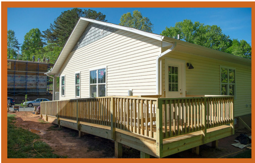
A side and back view of Asheville Area Habitat for Humanity's House of Faith #3 which 11 of our church members helped build. It is one of the first five of 34 homes including single-family, aging-in-place and townhome units that will be built in Habitat's Glenn Bridge neighborhood.

We will also have our annual Habitat Moment for Mission at the start of our Sept. 29 worship service, and, for the first time in many years, have a new Habitat homeowner with us that morning.