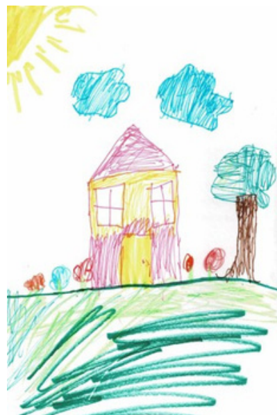
Pictured here are the hand drawn cards from some of the Bochkai family. A note written to the church is on the bulletin board in the Education Building